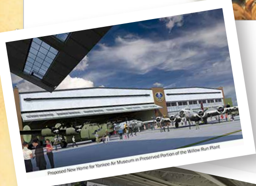
Proposed New Home for Yankee Air Museum in Preserved Portion of the Willow Run Plant